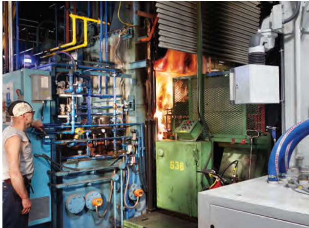
Lose the flames!