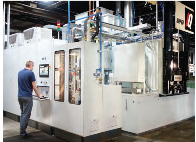
Go clean – Super IQ integrates with older gas carburizers and material handling systems.